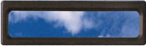
8" x 24"