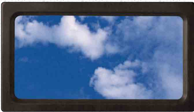
16" x 34"