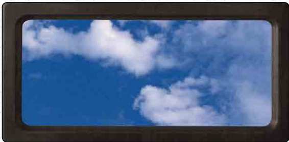
12" x 24"